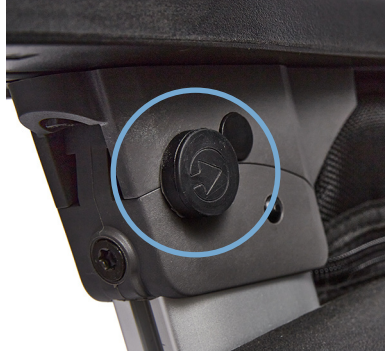
For wheelchair frames made of non-magnetic material, you can attach the self-adhesive magnetic buds at the desired position.

Magnets have been incorporated into the padding, so that both sides of the belt can be conveniently stuck to the frame of the wheelchair, making it easier for the client to get in and out of the chair (fig. 14,15).