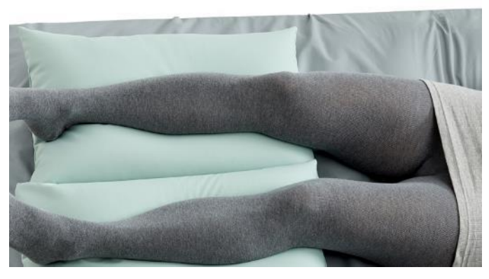
Large Cobi cushion under lower legs.