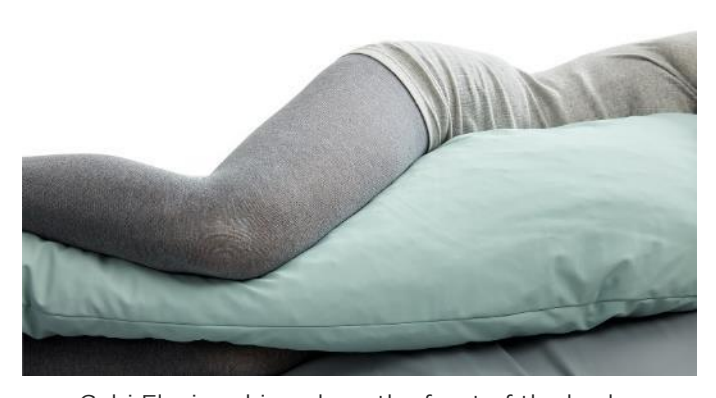
Cobi Flexi cushion along the front of the body.

70%) or a chlorine product 1000-1200 ppm (e.g., Wet Wipe Chlorine Desinfection).