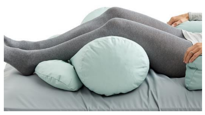
Cobi U-cushion under the upper body. Cobi Cylinder cushion short under the knees. Cobi Fin cushion under the lower calves.

For surface disinfection of the cushions use disposable cloths with ethanol (e.g., Wet Wipe