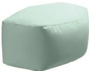
Cobi Universal cushion