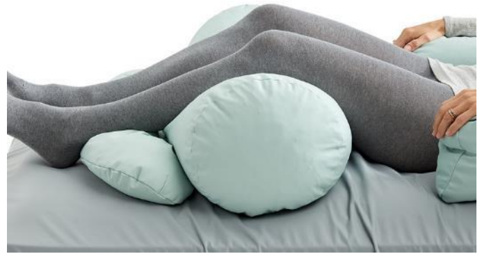
Cobi U-cushion under the upper body. Cobi Cylinder cushion short under the knees. Cobi Fin cushion under the lower calves.

For surface disinfection of the cushions use disposable cloths with ethanol (e.g., Wet Wipe