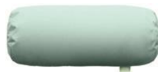
Cobi Cylinder cushion short