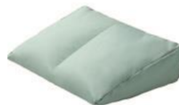
Cobi Wedge cushion

You can always contact Cobi Rehab on telephone +45 7025 2522 or e-mail cobi@cobi.dk if you want more information about Cobi Positioning Cushions.