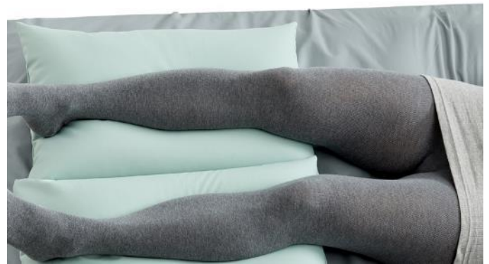
Large Cobi cushion under lower legs.