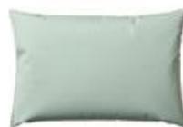
Cobi Small pillow