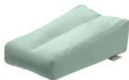
Cobi Heel/arm cushion