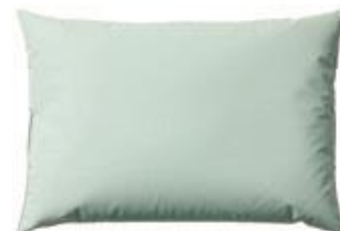
Cobi Large pillow