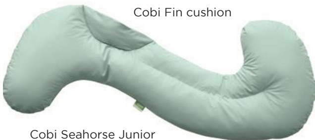
Cobi Seahorse Junior cushion