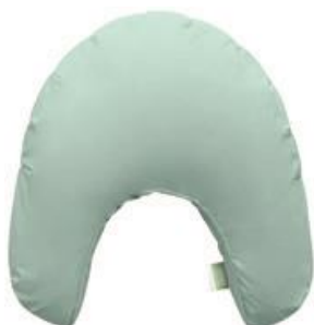
Cobi Lap cushion