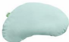
Cobi Fin cushion