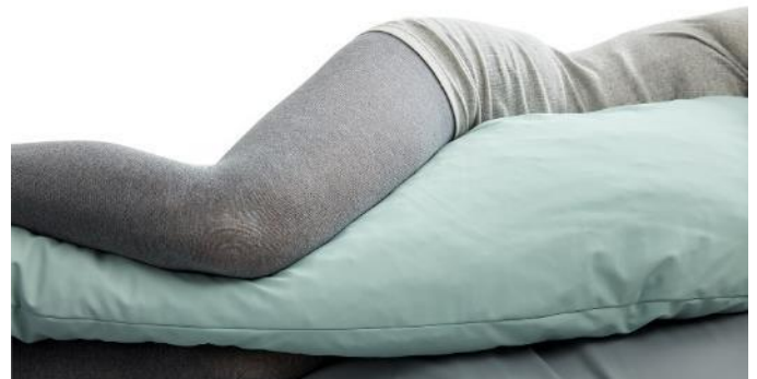
Cobi Flexi cushion along the front of the body.

70%) or a chlorine product 1000-1200 ppm (e.g., Wet Wipe Chlorine Desinfection).