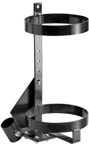
O2 Holder 0100-999-021