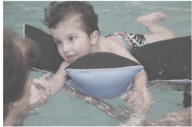
Positioning with a T-Cushion in the water.

Despite Cobi Flotation Cushions' floatability, they are never to be regarded as life jackets or other rescue equipment.