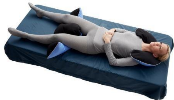
T-hygiene Cushion and Banana S Hygiene Cushion.

The blue and black colored cover is 100% polyester.