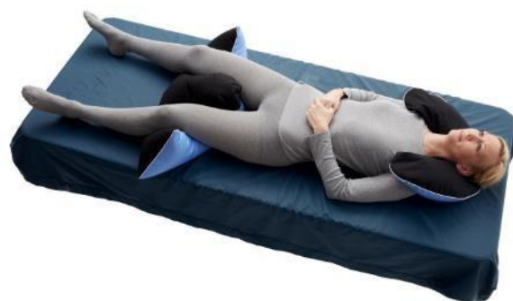
T-hygiene cushion and Banana S Hygiene cushion.