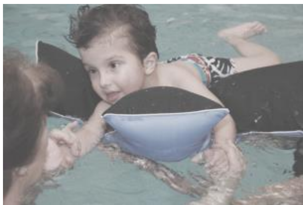
Positioning with a T-cushion in the water.

The cushions can dry with use of a large tumble dryer on low heat. A drying cabinet can also be used.