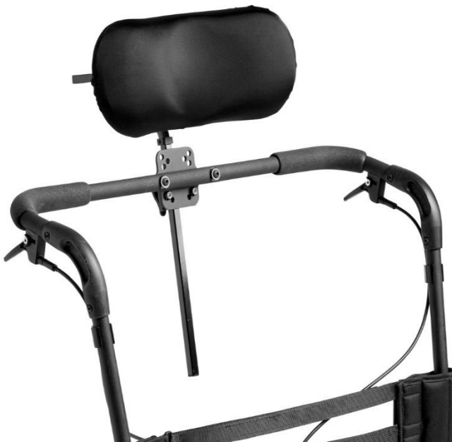
Headrest complete 0120-999-103