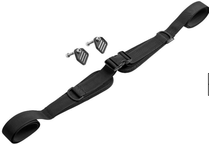
Belt for user 0120-999-062