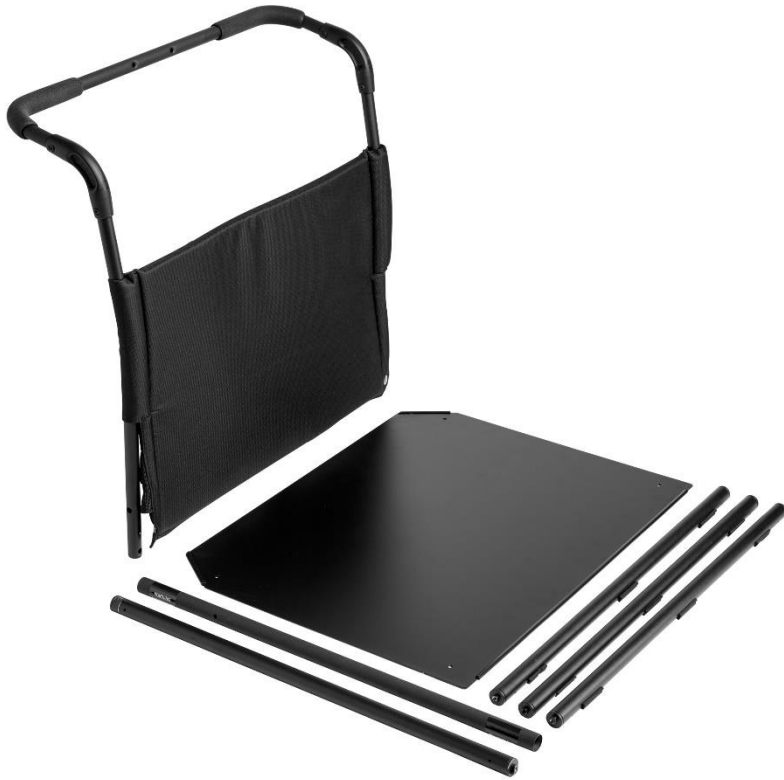
Grow Kit 5-16 cm 0120-999-030