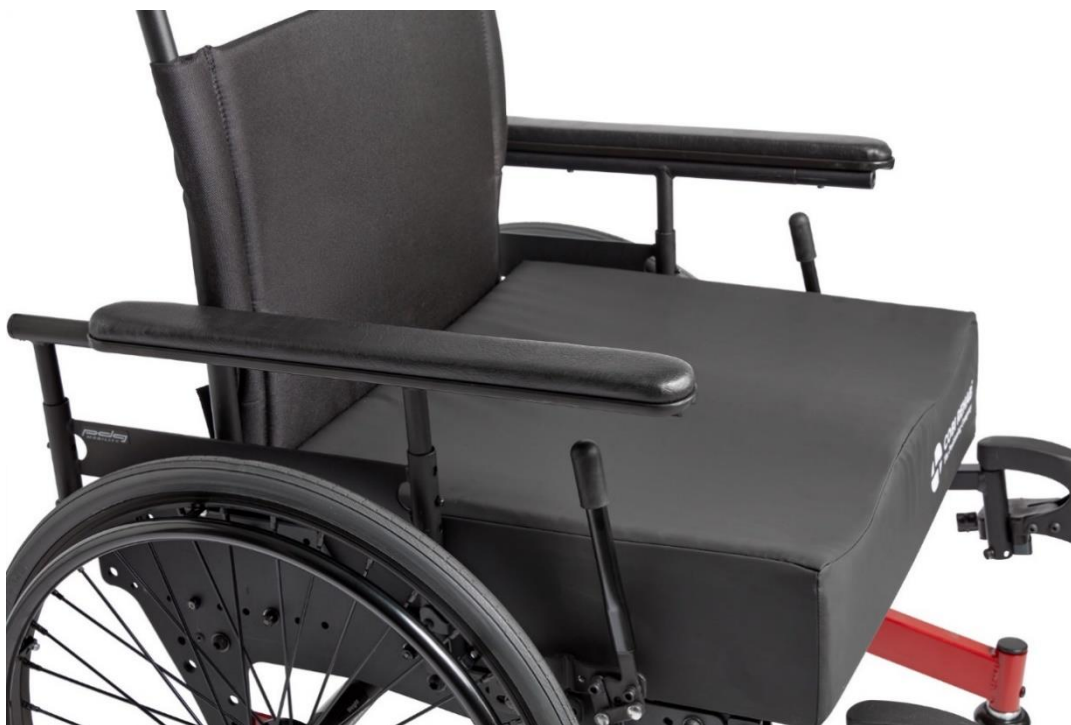
Extended armrest 0120-999-077 Left 0120-999-078 Right