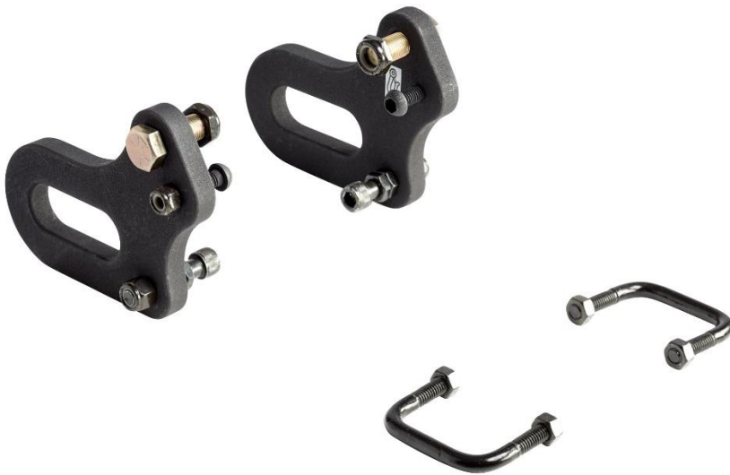
Transit tie down kit 0120-999-066