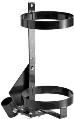
O2 Holder 0100-999-020