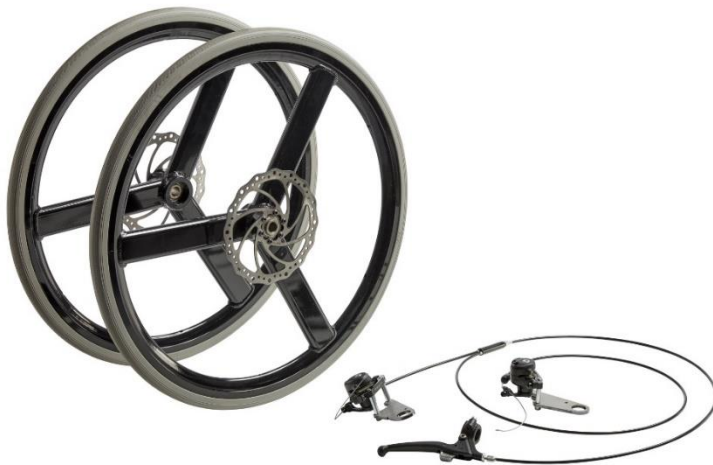
Disc brakes set 0120-999-022