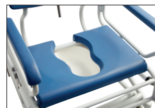
Split toilet seat