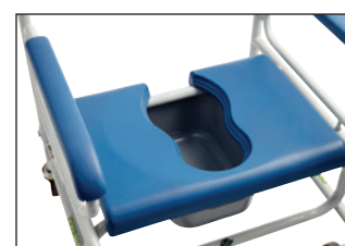
Split toilet seat