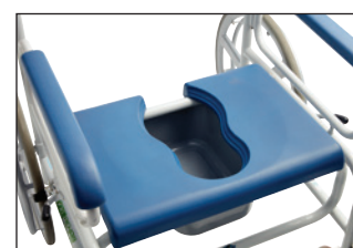
Split toilet seat