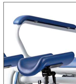
Calf support / amputation support