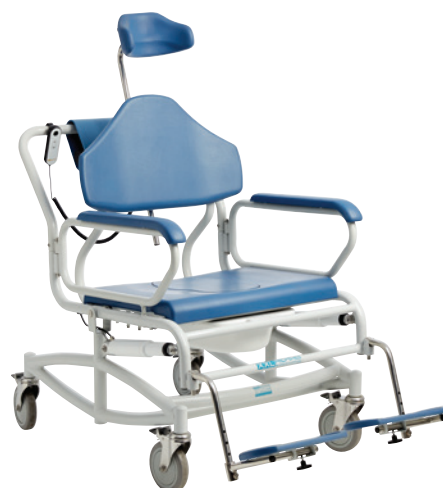
With standard footrests