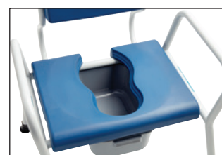
Split toilet seat