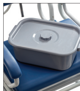
Commode bucket with lid