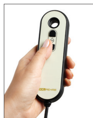
The handset gives the caregiver control over battery-powered functions