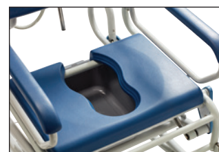
Split toilet seat