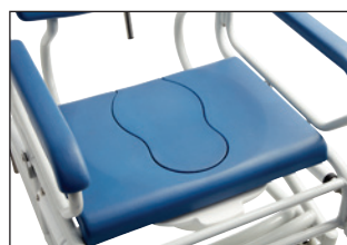
Seat with lid