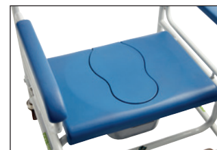
Seat with lid