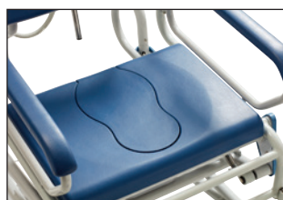
Seat with lid