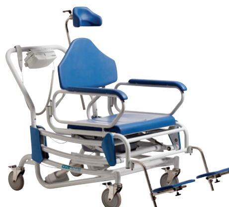
In lowest position with standard footrests