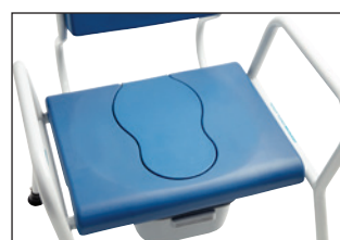
Seat with lid