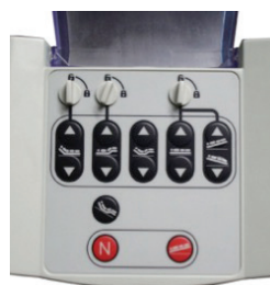
Caregiver control panel