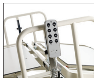
User hand control