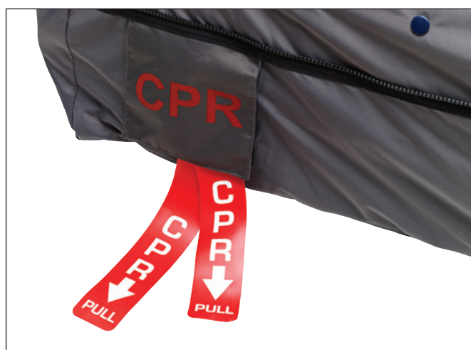
Easy CPR function. The mattress requires high bed rails.