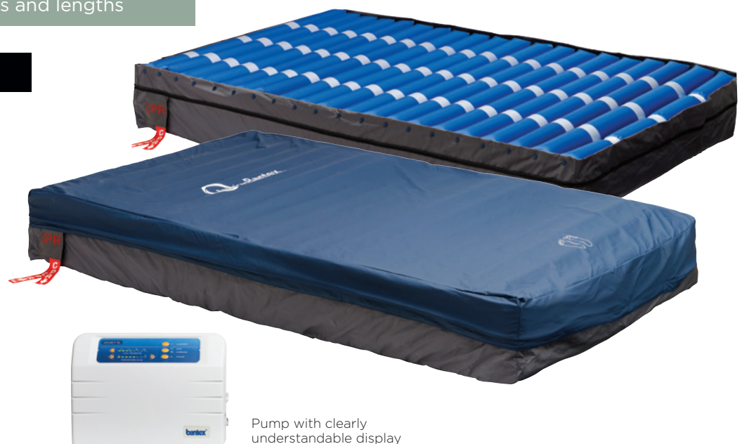
Pump with clearly understandable display