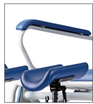
Calf support / amputation support